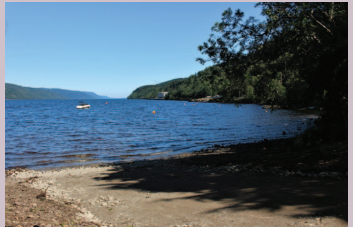
Foyers Bay Slipway