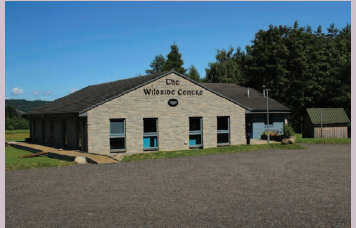
The Wildside Centre

Those visiting our buildings will be able to do so with relative ease. This applies to physical accessibility whereby improvements have been put in place to make it much easier for those with varying needs to enter and move around the building. For example, at Wildside we improved the walkways and have ramps out of fire exits based on your feedback.