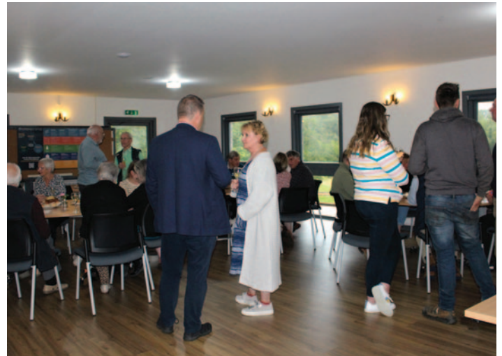
Volunteer Thank you event at The Wildside Centre last year.

and belonging. Once completed this will be an example of what can be achieved when the community works together. The projects will provide multiple opportunities for people to get involved in their community. These changes will enable people to improve their confidence and self-esteem, as well as long-term health, and therefore leave them better placed to take advantage of other opportunities open to them.