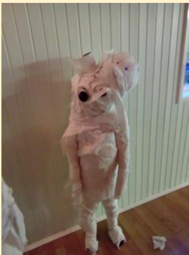
One way of keeping a Brownie quiet!