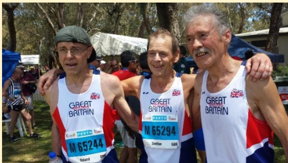
Above: “Team GB after some “warm work”! Right: Medal time – well done lads!

It was a very rewarding experience and I am grateful to the SFCT for their support.