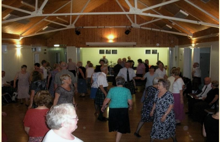
Now that's commitment!