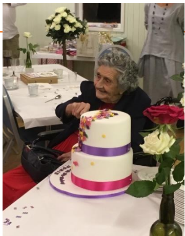
A splendid cake on a wonderful day!