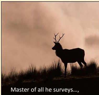
Master of all he surveys...

There is nothing better than waking early to see a starry bright sky, with a stunning full moon shining in the window, knowing that from the calmness of the dawn it is going to be a good day. For gamekeepers, and general countryside enthusiasts, the weather is one of the most important parts of the job, but the one thing we cannot rely on or change. Autumn is the epitome of “changeable”. With blustery winds blowing the leaves off the trees, to sleet in your face, to a calm sunny warm day, you really can have all seasons in one day.