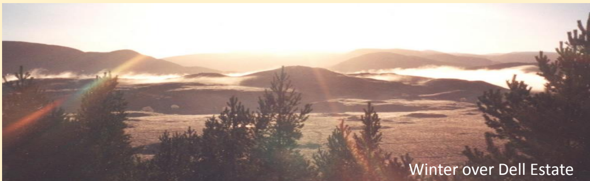
Winter over Dell Estate

It's certainly not all hardship though, as the benefits far outweigh the struggles. The satisfaction of giving the clients a fantastic day, with a dram and a hearty meal at the end of it, can certainly make up for soggy boots!