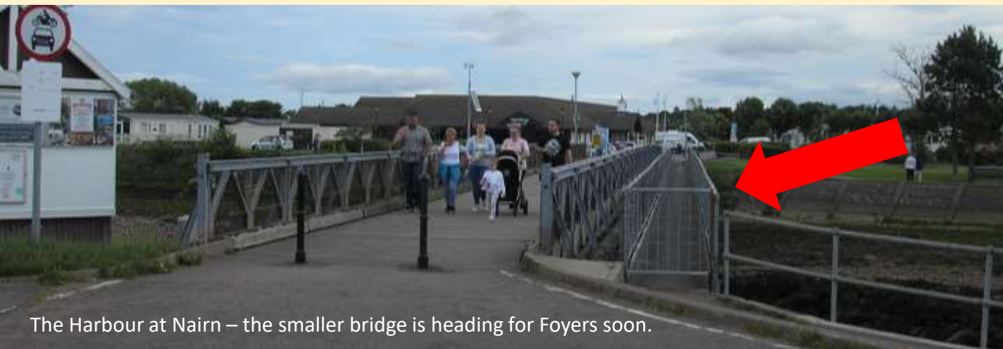
The Harbour at Nairn – the smaller bridge is heading for Foyers soon.

Highland Council has contracted with MacGregor Construction who will carefully remove the panels from Nairn and attach them to the side of the existing bridge at Foyers. The contract will commence in early September at Nairn. The work is not expected to cause much disruption to vehicle traffic at Foyers and should be completed by Christmas.