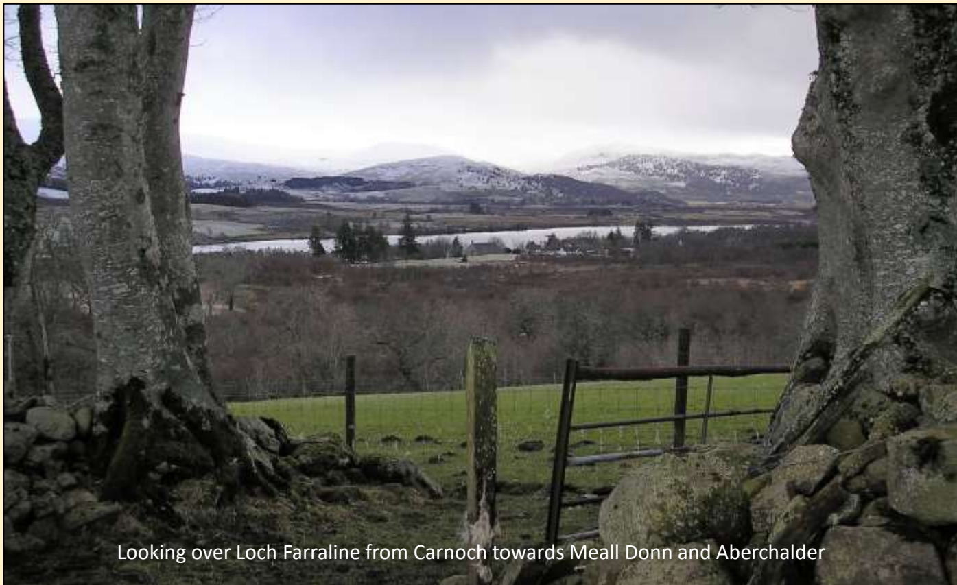
Looking over Loch Farraline from Carnoch towards Meall Donn and Aberchalder