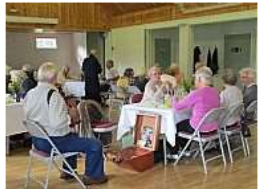
The Seniors Lunch Club at the Stratherrick Hall

Next year's Great Wilderness Challenge is on 11 August 2018 www.greatwildernesschallenge.info