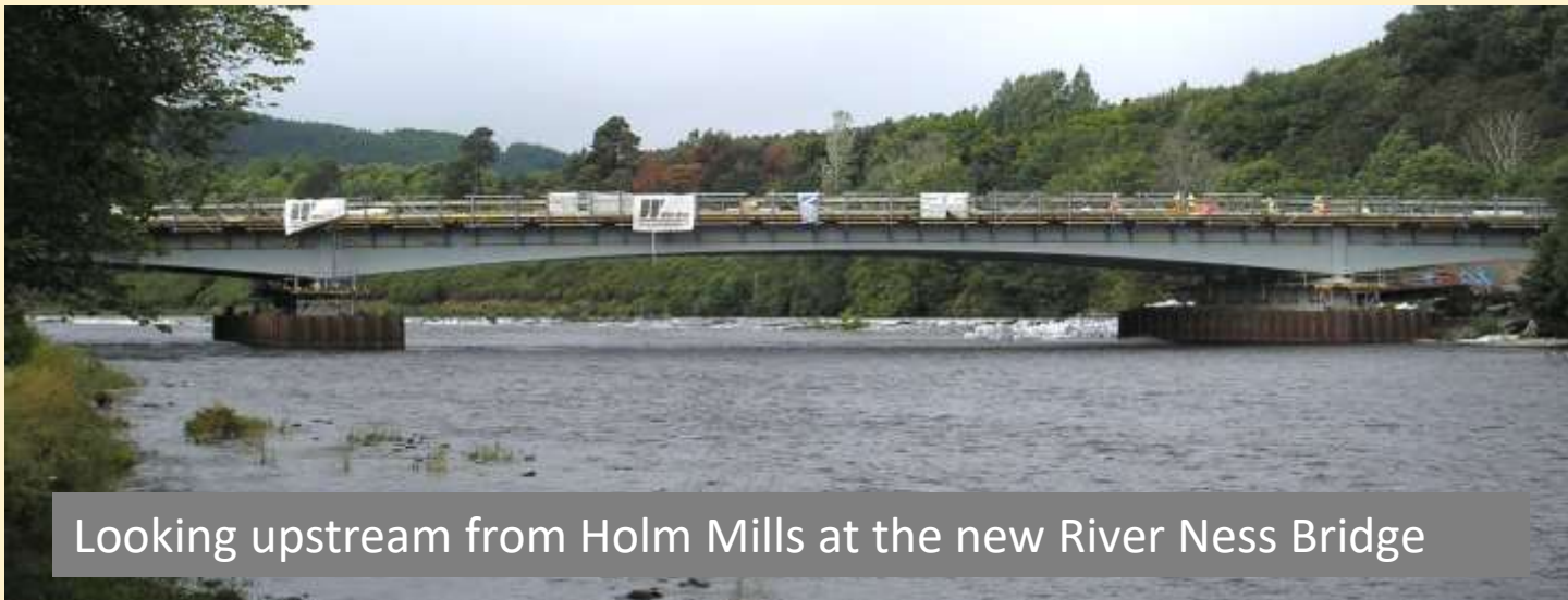
Looking upstream from Holm Mills at the new River Ness Bridge

The first pedestrians have crossed the new River Ness bridge which forms part of the Westlink / Southern Distributor Road. The new bridge across the River Ness links Torvean, beside the rugby club to a point just upstream of Holm Mills. The road will continue to the Dores Road Roundabout near the Tesco store. Councillors and Council staff were invited to cross the new bridge on foot in early August under the watchful eye of the contractors. The road is expected to open in December 2017. The new river crossing will cut journey times for Inverfarigaig drivers heading for Dochgarroch, Clachnaharry, Drumnadrochit or Beauly who will soon be able to avoid Inverness City Centre by using the new crossing.