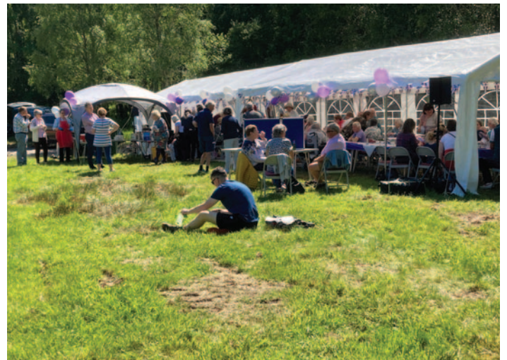
Guests at the Jubilee Celebrations soak up the afternoon sun