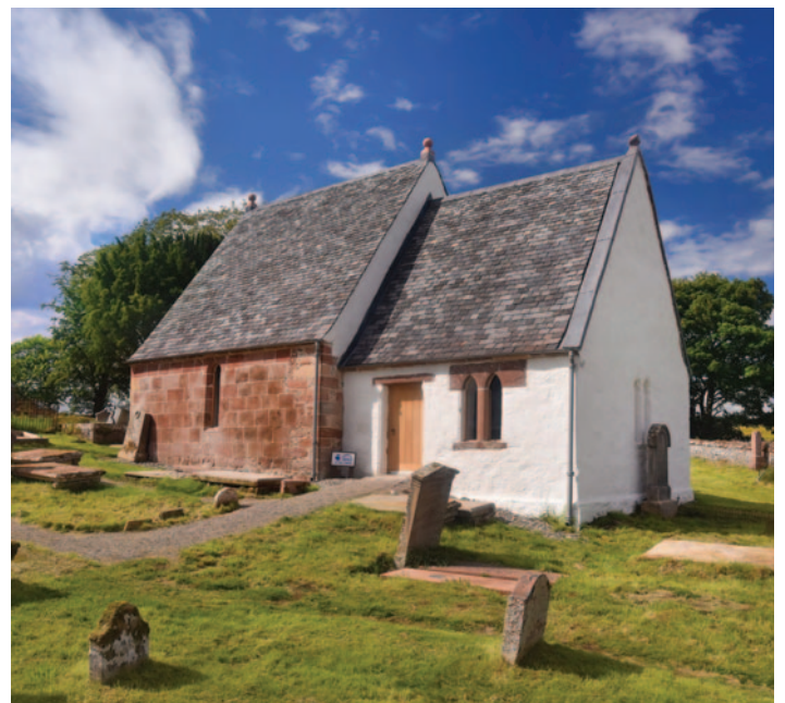
The newly renovated Kirkmichael Church, photo courtesy of the Kirkmichael Trust