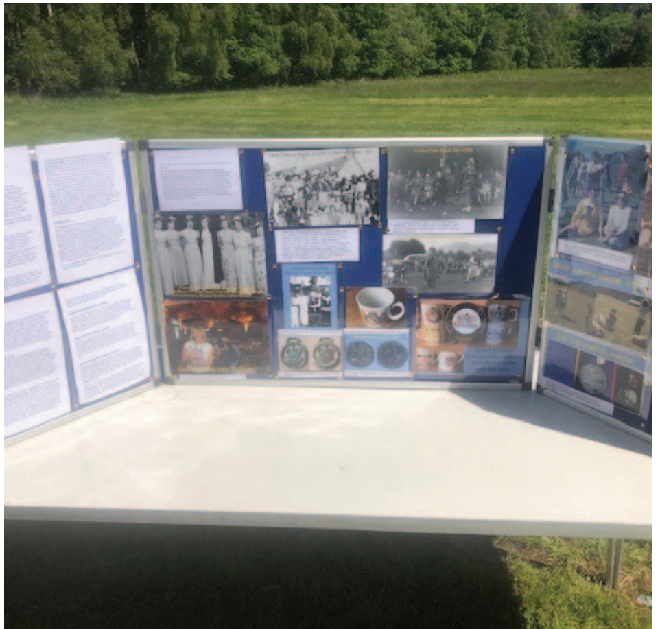
Celebrating jubilees past